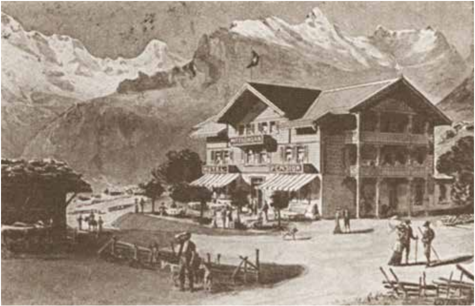
Gimmelwald near Mürren - Hotel & Pension Mittaghorn, vision around 1909